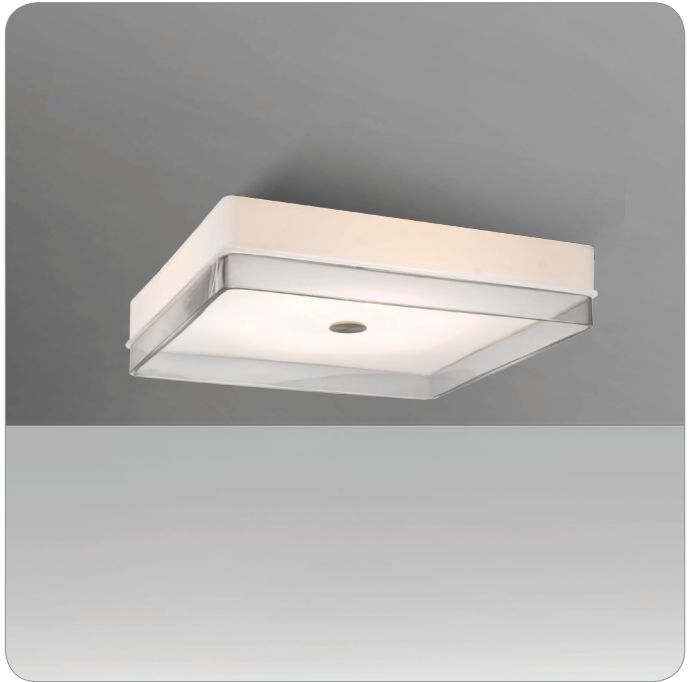
OPAL GLOSSY/CLEAR (BOXERCLC-LED)

UL or ETL Listed. Suitable for Damp Locations (interior use only).